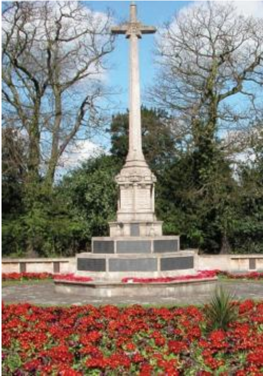
Brentwood War Memorial